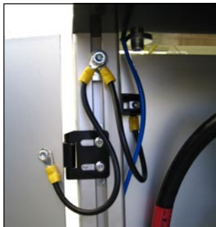
ESD version Part No. 78201-010091