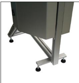
Stand version Part No. 78201-010089