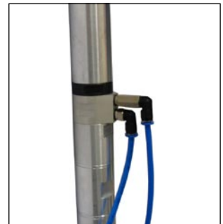
Air cursor Part No. 78201-010087