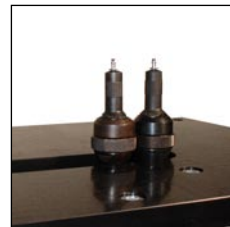
Standard nose equipment

** for fasteners \lt \varnothing 2.4 mm the air cursor option is recommended