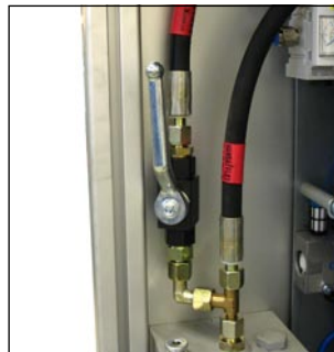
Single module switch-off Part No. 78201-010090