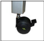
Lockable Wheels Part No. 78201-010088