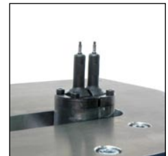
Riveting pitch reduced to 17 mm can be realised with the CP version (CP = close pitch).