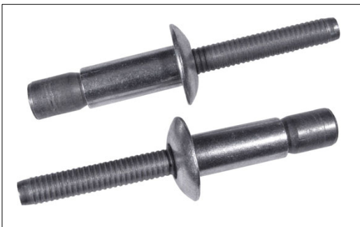
The new Monobolt® 3/8" aluminium fastener.

Avdel® is one of the leading global product brands from Infastech™. Avdel has been a technology leader for more than 70 years and our range of blind fasteners and tooling is one of the widest in market. Infastech offers Avdel products through Sales, Distribution and Manufacturing facilities in over 150 countries serving all market segments with innovative fastening and assembly solutions. www.avdel-global.com , www.infastech.com